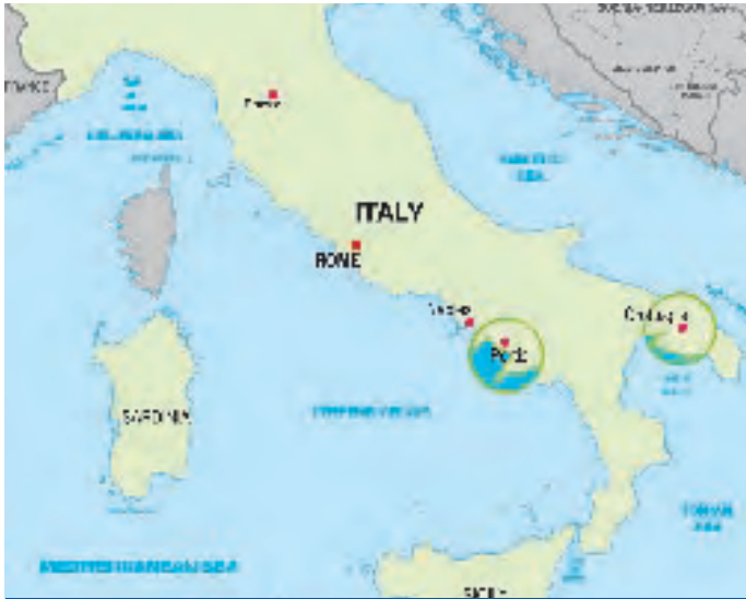
Government officials in southern Italy are keen on strengthening the high-tech skill base in the region of Campania, where Naples and Portici are located. It's also true in Puglia, where Alenia is building key 787 Dreamliner elements in Grottaglie.

Force purchase of four KC-767A Tankers (Italy was the tankers' international launch customer).